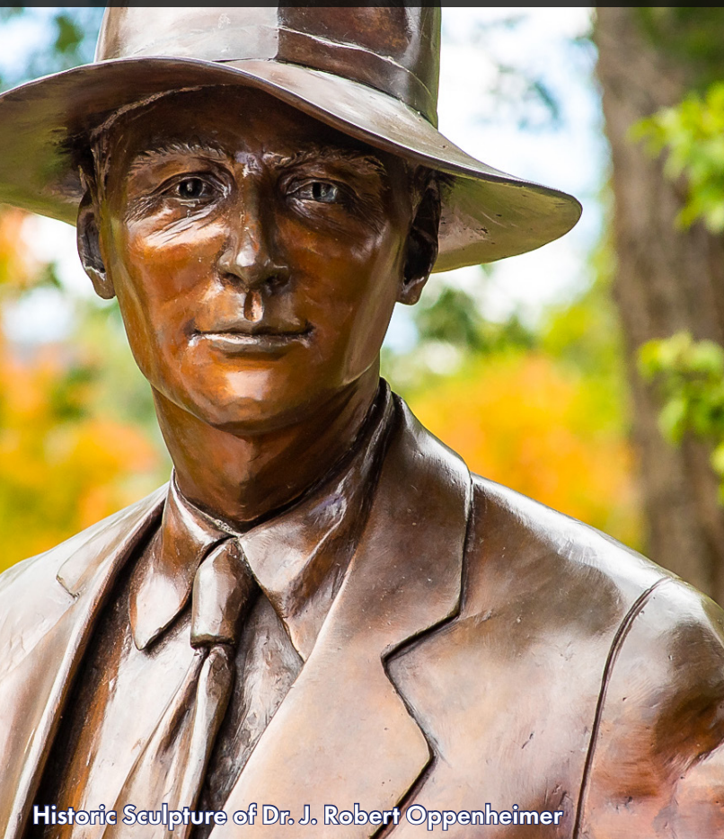
Historic Sculpture of Dr. J. Robert Oppenheimer

Once you've made the journey to Los Alamos, you can begin to understand how much the culture and the people are defined by this remote and beautiful landscape. While Los Alamos is known to many as the birthplace of the atomic bomb, the town's history dates back 1.6 million years with a different kind of energy—volcanic eruptions that created the Pajarito Plateau and the mesas and canyons where communities have settled for millennia: Ancestral Pueblo people, Homesteaders, Ranch School students, and thousands of scientists, soldiers, and engineers from all over the world who came to work on the Manhattan Project and stayed to create the Los Alamos community. Experience the dynamic history of this great place by visiting the museums, National Parks and other attractions profiled in this guide.