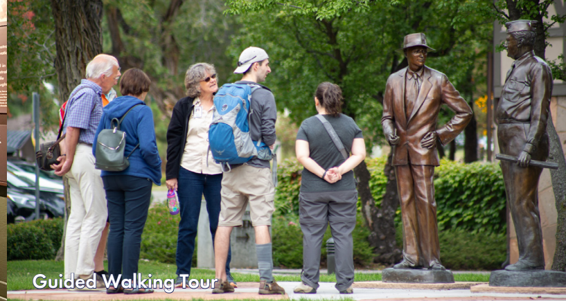
Guided Walking Tour