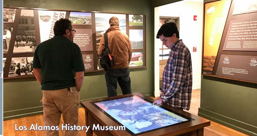
Los Alamos History Museum